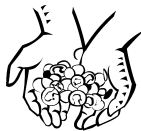
Tithes and offerings

Please come and expect an enjoyable evening, while supporting our high school youth!