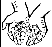
Tithes and offerings