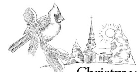
Christmas Morning Service

THIS Wednesday, December 25— Come and worship the newborn King with us on Christmas morning at 9:30am.